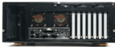
Rear Fan (Exhaust) : Dual 60 x 60 x 25 mm silent fan, 2500rpm 19dBA.