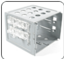
Removable HDD cage for easy installation