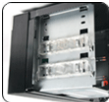
Tool-free installation for 5.25" device