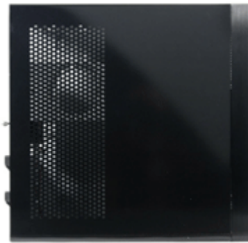
Ventilation opening on top