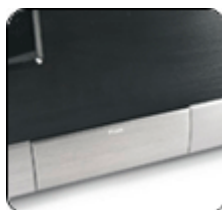
Metallic feel front access cover