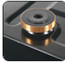
Stylish Gold-plated Foot Stands