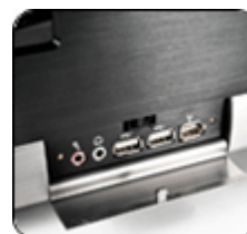
USB2.0 & 1394 ports & HD Audio