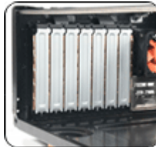
Screwless slots for easy assembling