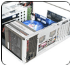
Internal Structure overview