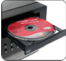
Accessible DVD Drive Bay w/o Opening Front Door