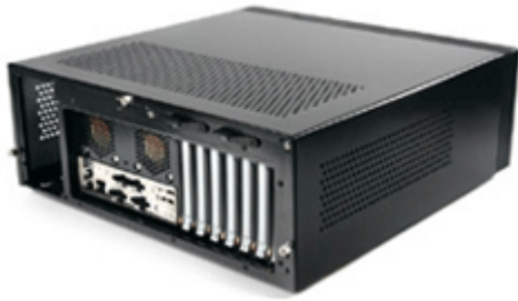
Ventilation opening on top and side