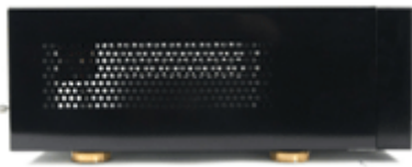
Ventilation opening on side