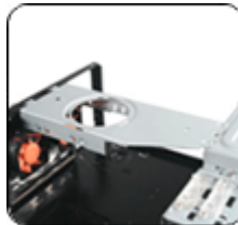
Bridge for Strengthening Case Structure