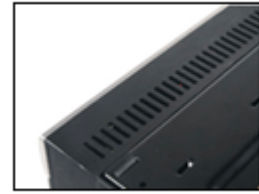
Intake vents - Minimizes Overall Noise