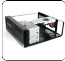
Internal Structure overview