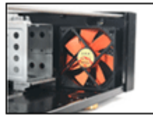
Front Fan (intake) : 120 x 120 x 25 mm silent fan, 1200rpm, 16dBA